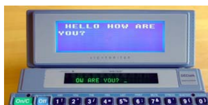
four lines of small text

It is designed for keyboard users with short-term memory difficulties (several sentences can be viewed on screen at once), or for users with severely impaired vision.