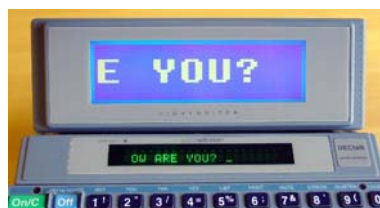
one line of large text