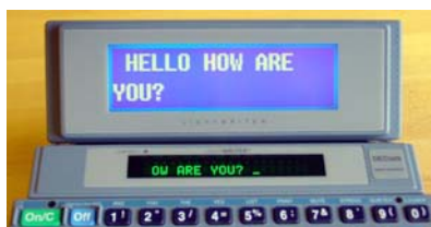
two lines of medium text